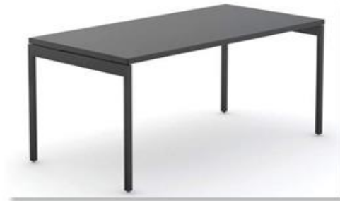
60 x 27 x 30