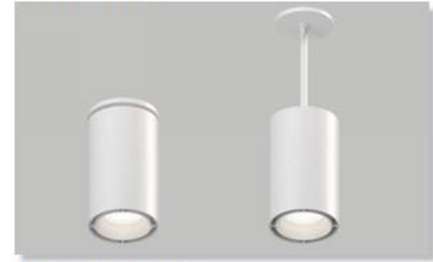
USAI BeveLED 2.1 Cylinder