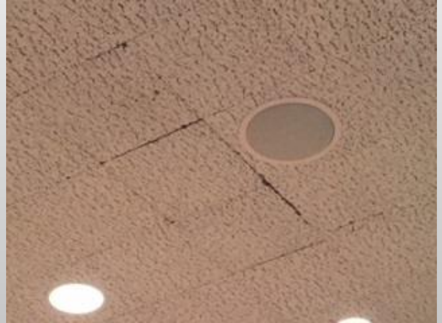
Acoustic tile damage