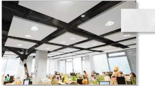
48 in x 48 in White