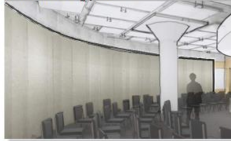
Paint exposed utilities, ceiling, wall, and columns gray to unify the space.